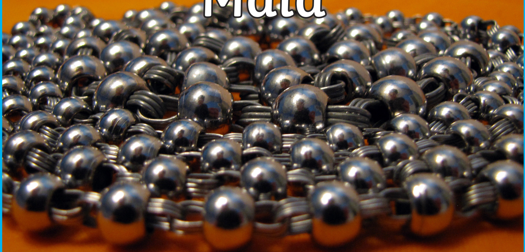
Sikh prayer beads or mala, used in meditation.